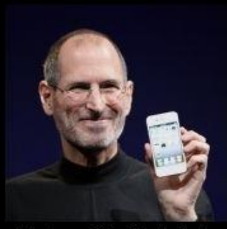
What society thinks I do.